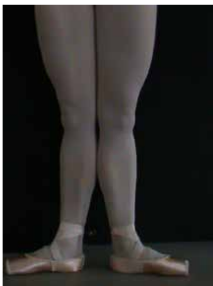
Figure 4a: usage of the first position with a large gap

The use of first position can be particularly difficult for young dancers with hypermobile knees. There has been debate about whether hypermobile dancers should leave a small gap in the heels at first, to allow for some sensation and more effective engagement of the quadriceps and adductor muscles, and to close the gap over time as the dancer gains better control.