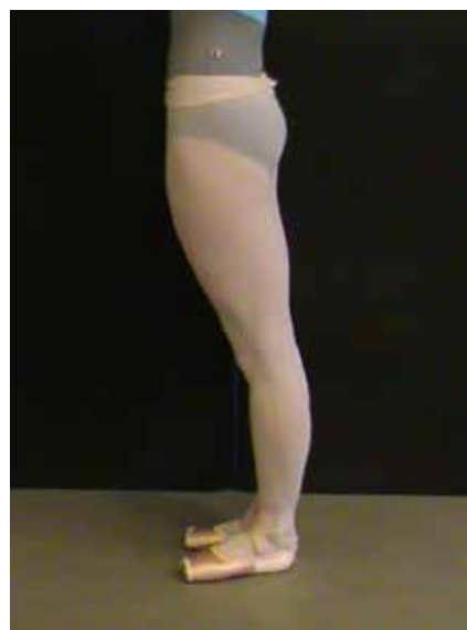
Figure 3b: posture corrected