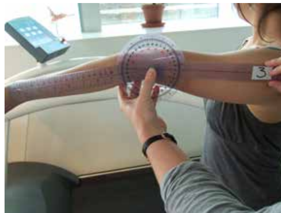
Figure 1: Hyperextension of the elbow by more than 10 degrees as measured with an angle goniometer