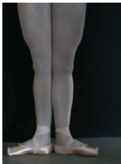
Figure 4b: the same dancer but with the use of adductors

Exercises in classical ballet that require the dancer to go through the first position can also be a challenge, but this will also depend upon the leg shape, the degree of knee hyperextension and how well the dancer manages the control of the range of movement. Re-education is certainly possible, but takes patience, time and the support and guidance of an experienced teacher.