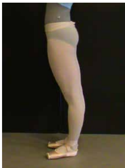
Figure 3a: swayback posture

Hypermobile people often have poor posture and can be seen to be slouching, adopting 'end of range' postures and hanging into their hypermobile joints. They might be observed standing with their legs crossed or leaning on the edges of their ankles, sinking into the front of the hips and the backs of the knees in the typical 'swayback posture,' (see Figures 3a and 3b). Very often individuals exhibit these 'strange' postures as a way of gaining some stability and control which they are frequently lacking.