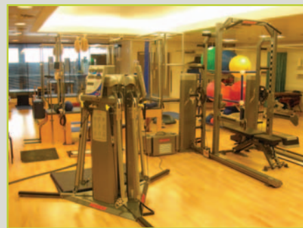
Jerwood centre